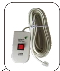
Order No.: RC-1700