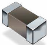
CS160808-68NK Multilayer Chip Inductor