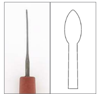
RED: large tip