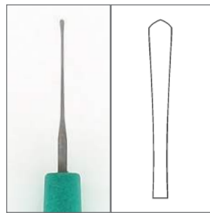
GREEN: medium tip