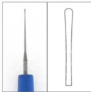
BLUE: fine, pointed tip