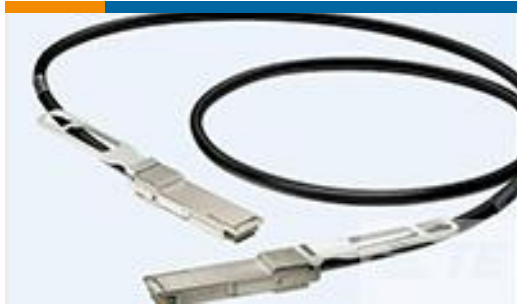
TE Part # 2829040-6 QSFP IB EDR, 30AWG, 2.0M