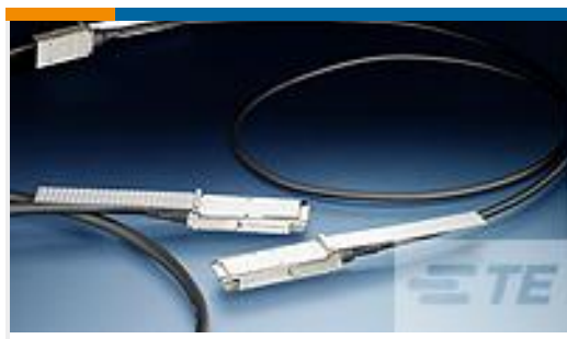
TE Part # 2202165-4 QSFP TO QSFP, 26AWG, FDR, 4.0 METER