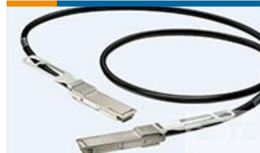
TE Part # 2829040-8 QSFP IB EDR, 26AWG, 3.0M