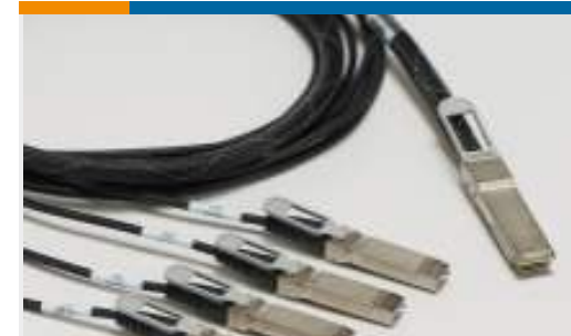
TE Part # 2821033-8 QSFP TO [4]SFP+, 28G, 1M, 33AWG