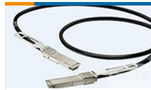
TE Part # 2829040-4 QSFP IB EDR, 30AWG, 1.0M