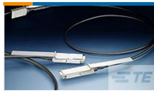
TE Part # 2202165-5 QSFP TO QSFP, 26AWG, FDR, 5.0 METER