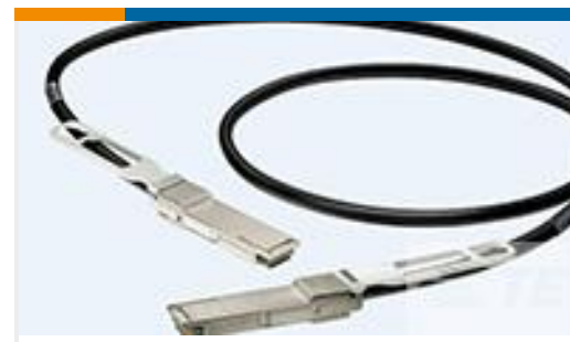
TE Part # 2829040-2 QSFP IB EDR, 33AWG, 1.0M