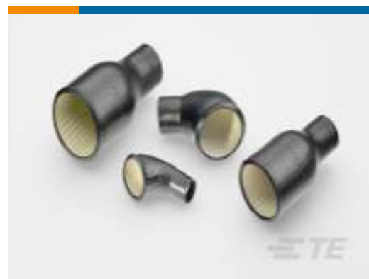
TE Part #EK7310-000 222S142-25C-0