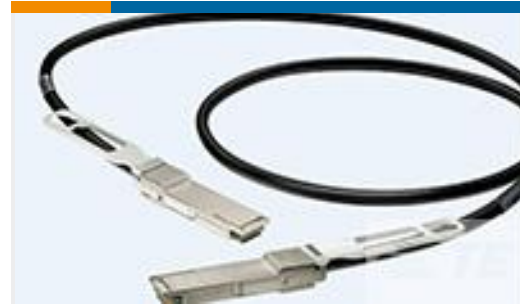
TE Part # 2829040-7 QSFP IB EDR, 26AWG, 2.0M