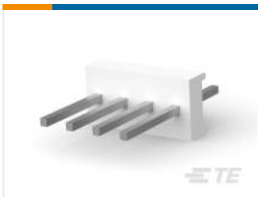
TE Part #640456-8 PCB Header: Polyester, Vertical, Unshrouded, No Mating Alignment