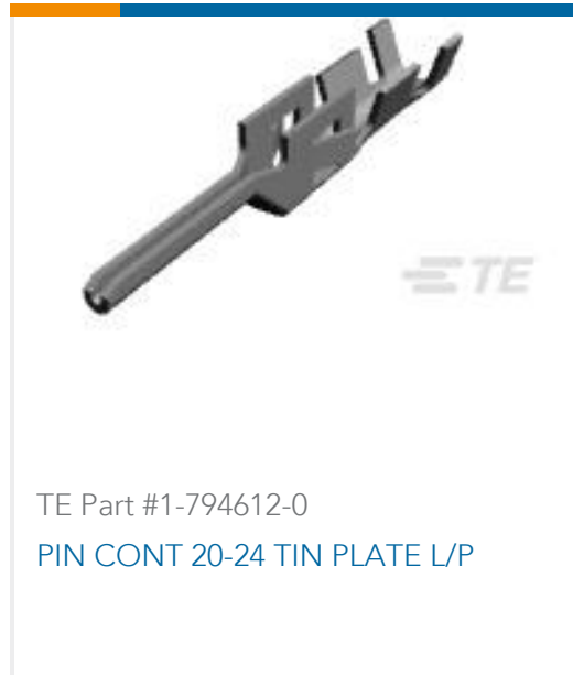
TE Part #1-794612-0 PIN CONT 20-24 TIN PLATE L/P