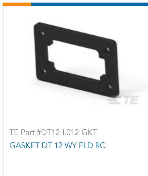
TE Part #DT12-L012-GKT GASKET DT 12 WY FLD RC