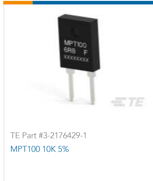
TE Part #3-2176429-1 MPT100 10K 5%