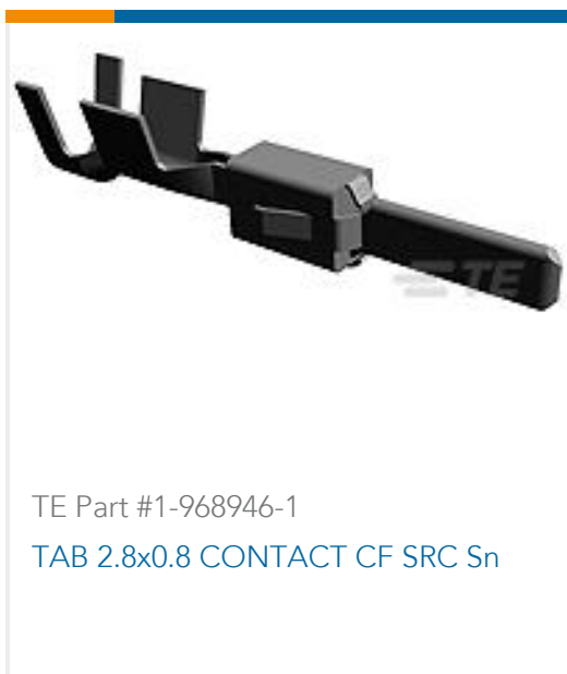
TE Part #1-968946-1 TAB 2.8x0.8 CONTACT CF SRC Sn