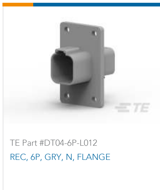
TE Part #DT04-6P-L012 REC, 6P, GRY, N, FLANGE