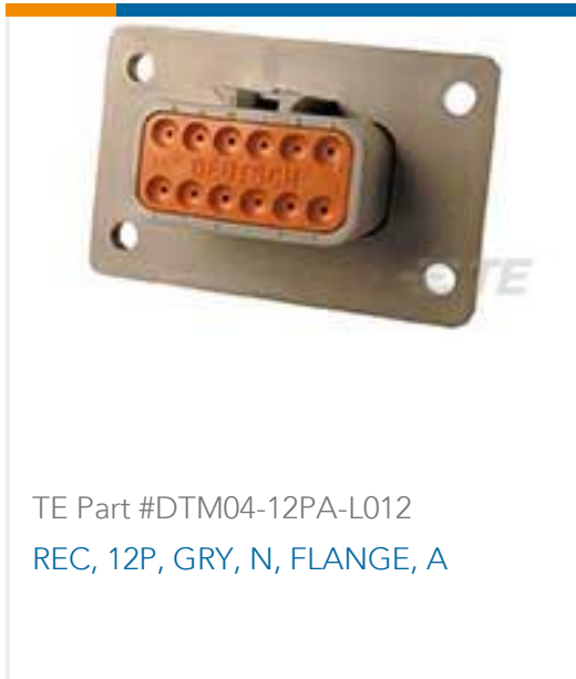
TE Part #DTM04-12PA-L012 REC, 12P, GRY, N, FLANGE, A