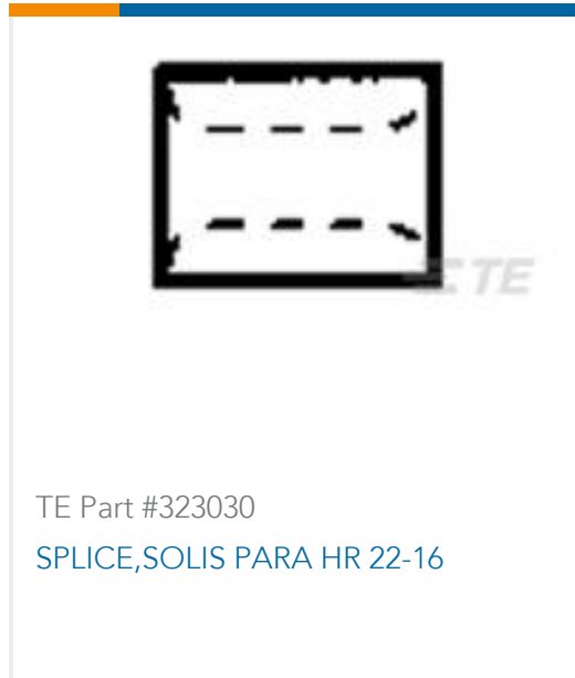
TE Part #323030 SPLICE,SOLIS PARA HR 22-16