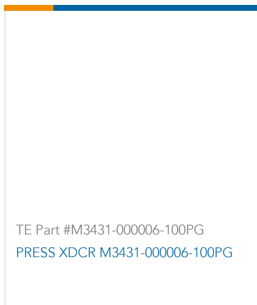
TE Part #M3431-000006-100PG PRESS XDCR M3431-000006-100PG