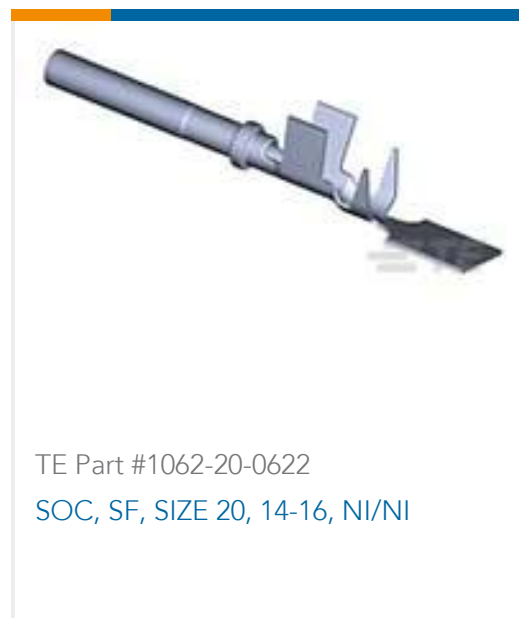
TE Part #1062-20-0622 SOC, SF, SIZE 20, 14-16, NI/NI