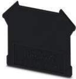
Cover for setting the end of a TT-UK 5 row of terminal blocks, color: black

Please be informed that the data shown in this PDF Document is generated from our Online Catalog. Please find the complete data in the user's documentation. Our General Terms of Use for Downloads are valid ( http://download.phoenixcontact.com )