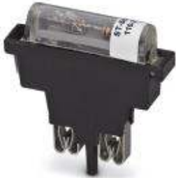
The figure shows ST-SILA250

Fuse plug, Nominal current: 6.3 A, Length: 45.4 mm, Width: 9.9 mm, Color: black