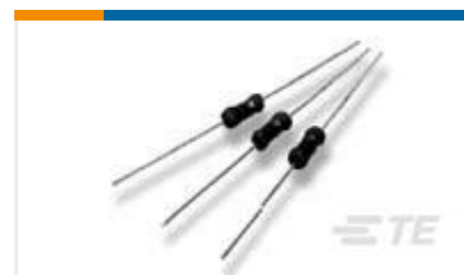
TE Part #3-1625892-7 3W SM M/OX 5% 2K2