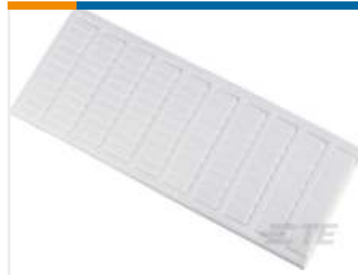
TE Part #1SNK145011R0000 MC512PA 1->100 Horizontal