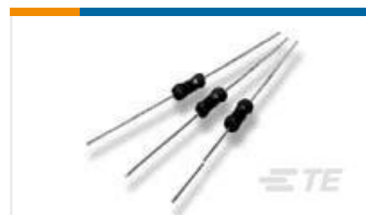
TE Part #1-1625890-4 2W SM M/OX 5% 15K