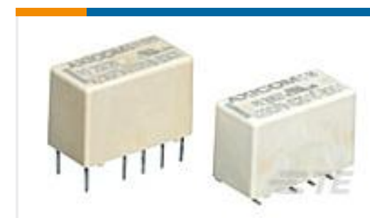
TE Part #1-1393788-6 V23079A1005B301