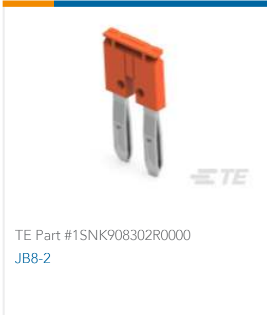
TE Part #1SNK908302R0000 JB8-2