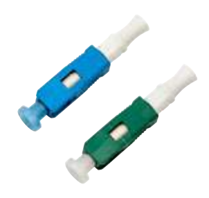
3M™ Crimplok™+ Connectors SC/UPC and SC/APC with Protrusion-setting Caps