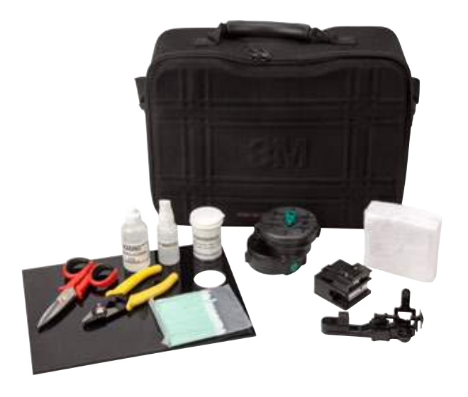
3M^{\tiny \square} Crimplok ^{\tiny \square}+ Connector Kit SC/APC 8765T-APC contains all the tools necessary for 3M^{\tiny \square} Crimplok ^{\tiny \square}+ Connector 8700-AT/APC