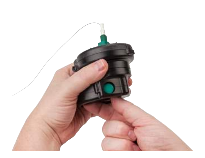
3M<sup>™</sup> Crimplok + Nano Finishing Tool SC/APC 8765-NF/APC