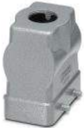
HEAVYCON sleeve housing B10, for double locking latch, height 72 mm, with thread 1x M25, straight conductor exit

Please be informed that the data shown in this PDF Document is generated from our Online Catalog. Please find the complete data in the user's documentation. Our General Terms of Use for Downloads are valid ( http://download.phoenixcontact.com )