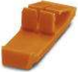
Latching, Color: orange