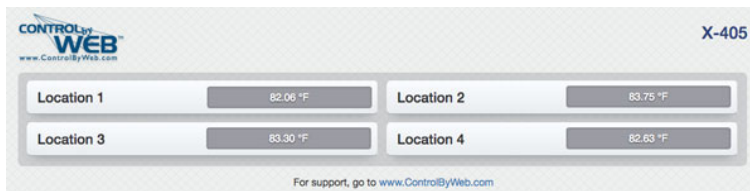
Example Control Page