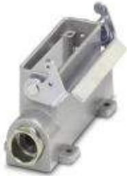
Box mounting base, with single locking latch, height 57 mm, with screw connection, 1x Pg21

Please be informed that the data shown in this PDF Document is generated from our Online Catalog. Please find the complete data in the user's documentation. Our General Terms of Use for Downloads are valid ( http://download.phoenixcontact.com )