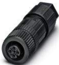
Connector, 5-position, Socket straight M12, A-coded, Spring-cage connection, knurl material: Plastic, external cable diameter 4 mm ... 8 mm

Please be informed that the data shown in this PDF Document is generated from our Online Catalog. Please find the complete data in the user's documentation. Our General Terms of Use for Downloads are valid ( http://phoenixcontact.com/download )