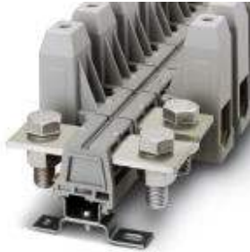
Universal terminal block with bolt connection, cross section: 70 - 240 mm 2 , width: 53 mm, color: gray

Please be informed that the data shown in this PDF Document is generated from our Online Catalog. Please find the complete data in the user's documentation. Our General Terms of Use for Downloads are valid ( http://download.phoenixcontact.com )