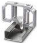
End clamp, for end support of UKH 50 - UKH 240, is pushed onto DIN rail NS 32 and fixed with 2 screws, width: 10 mm, color: Aluminum