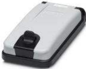
Mounting frame for one front plate/socket, frame: black, cover: gray, closed with rotary knob.

Please be informed that the data shown in this PDF Document is generated from our Online Catalog. Please find the complete data in the user's documentation. Our General Terms of Use for Downloads are valid ( http://phoenixcontact.com/download )