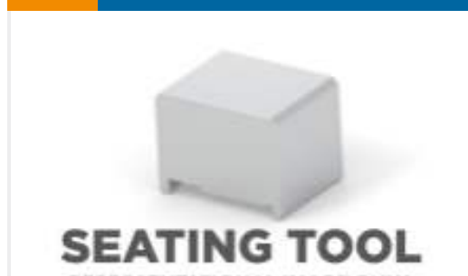
TE Part # 2018378-1 TOOL, SEAT 3 PR 16 COL, BP CONN