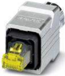
RJ45 plug-in connector, IP67, with push/pull interlocking (version 14), metal housing, for 10 Gbps, for AWG 24 ... 27 stranded conductors

Please be informed that the data shown in this PDF Document is generated from our Online Catalog. Please find the complete data in the user's documentation. Our General Terms of Use for Downloads are valid ( http://download.phoenixcontact.com )