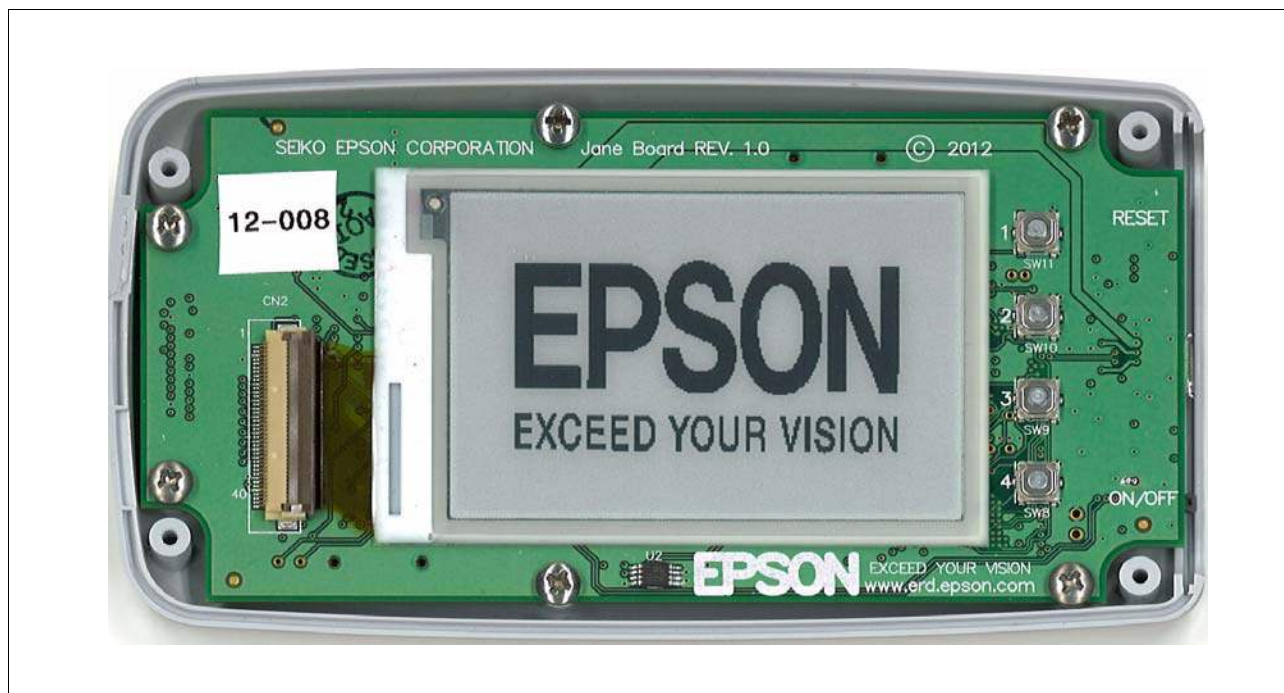
Figure 1-1: Jane-TCON EPD Demo Unit (Top View)

The unit is powered by an internal Li-Ion rechargeable battery or from a USB connection. The battery is charged by power from the USB connection. The unit has an Epson TCON, S1D13T03, and typically has mounted a 2.7" panel from PDI. The board can also use a 1.44" or 2" EPD panel from PDI. The main processor on the board is an Epson MCU, S1C17801, which has embedded an USB controller. The demos software, including the images are stored on a microSD card.