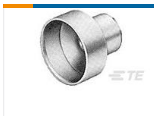
TE Part #3-747579-0 SHLDNG FERRULE, PLTD, BULK PKG