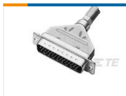
TE Part #1658677-1 HDP-22, OVRMLD, PLUG KIT, SIZE 3,