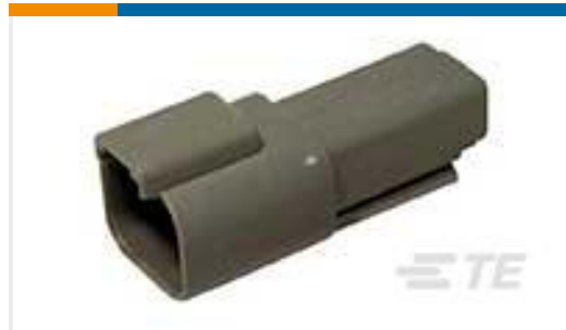
TE Part #DT04-2P REC, 2P, GRY, N