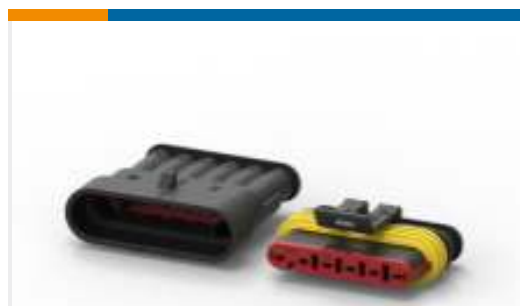
TE Part #282104-1 AMP SUPERSEAL 1.5MM, CONNECTOR HOUSING