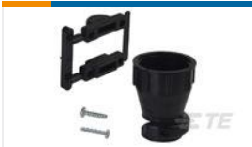
TE Part #206070-8 CABLE CLAMP KIT #17