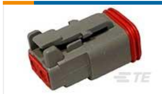
TE Part #DT06-2S PLG, 2P, GRY, N