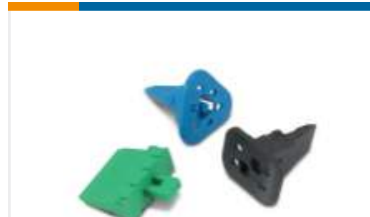
TE Part #W2P Wedgelocks: DEUTSCH DT