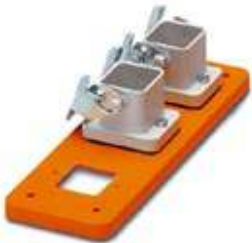
Adapter plates, with reinforced wall, 3 cutouts for connectors HC-D 7, cutout 3 x 21.5 x 21.5, for type B24 to D7

Please be informed that the data shown in this PDF Document is generated from our Online Catalog. Please find the complete data in the user's documentation. Our General Terms of Use for Downloads are valid ( http://download.phoenixcontact.com )