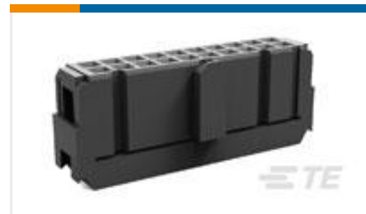
TE Part #1-1658621-1 60 NOVO MIL/CTR 15DP, LEAD FREE