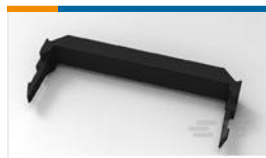
TE Part #499252-7 060 STRAIN RELIEF A-L RCPT