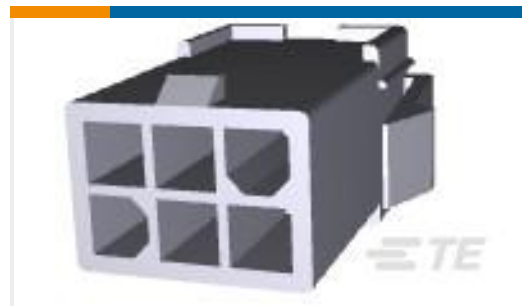
TE Part #172331-1 MINI UNIVERSAL MATE-N-LOK CAP HOUSING 6P