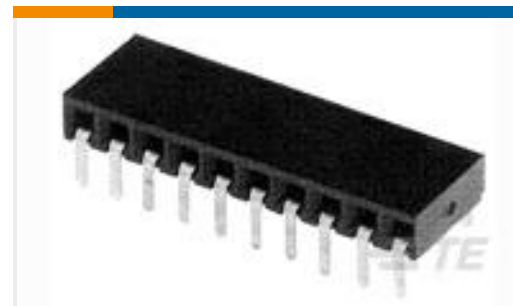
TE Part #216602-4 4P HV190 FEDERLEIS