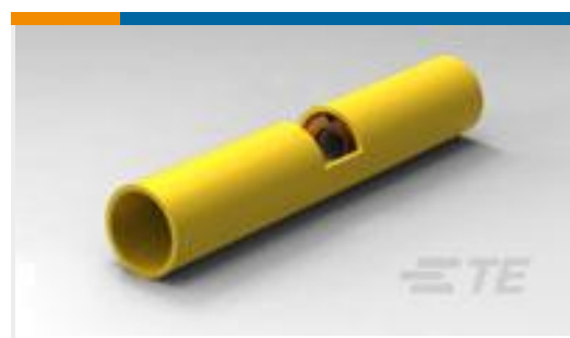
TE Part #327638 SPLICE BUTT PIDG 12-10/16-14