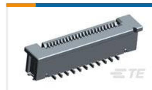
TE Part #4-1734742-0 .5 FPC VT ZIF Type-A 40 CONT