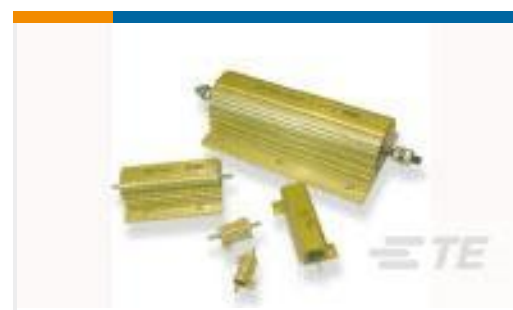
TE Part #4-1625971-7 HSA25 3R3 5%