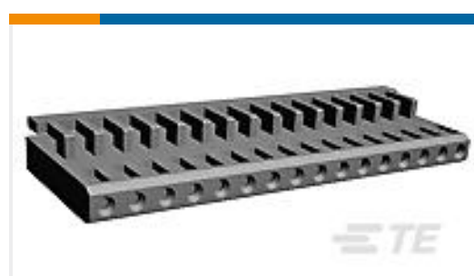
TE Part #926475-6 MOD IV HSG SR 6 POS