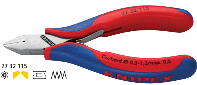
77 32 115 MM