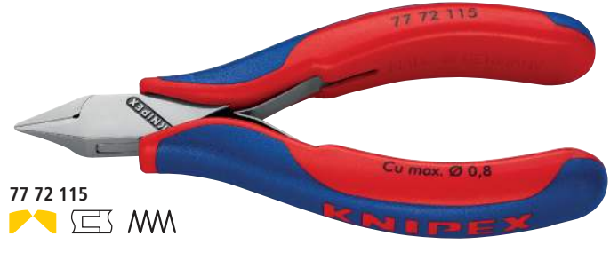
77 72 115 MM