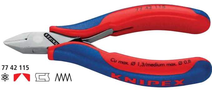
77 42 115 MM