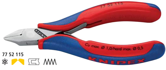
77 52 115 MM