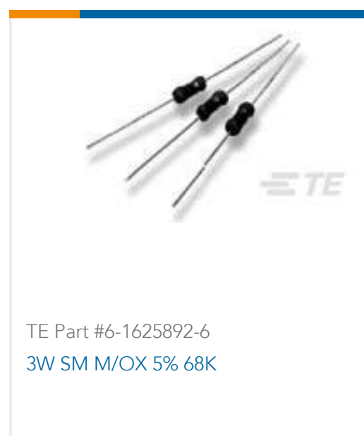
TE Part #6-1625892-6 3W SM M/OX 5% 68K