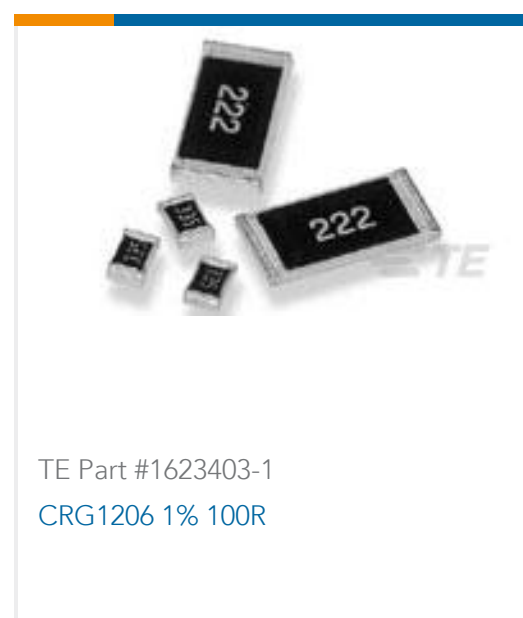
TE Part #1623403-1 CRG1206 1% 100R