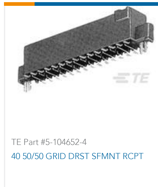
TE Part #5-104652-4 40 50/50 GRID DRST SFMNT RCPT