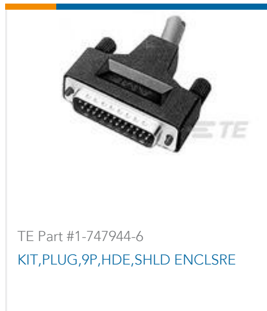
TE Part #1-747944-6 KIT,PLUG,9P,HDE,SHLD ENCLSRE