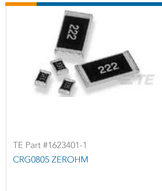
TE Part #1623401-1 CRG0805 ZEROHM