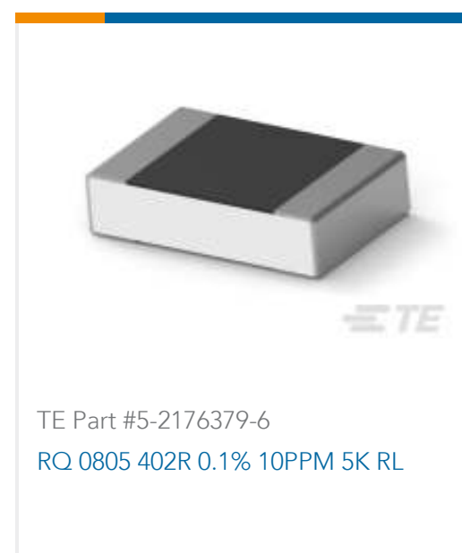
TE Part #5-2176379-6 RQ 0805 402R 0.1% 10PPM 5K RL