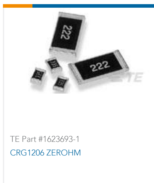
TE Part #1623693-1 CRG1206 ZEROHM