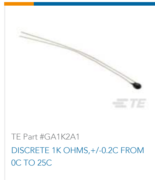
TE Part #GA1K2A1 DISCRETE 1K OHMS,+/-0.2C FROM 0C TO 25C