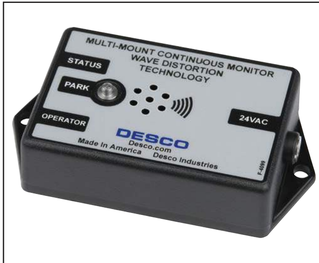
Figure 1. Desco Multi-Mount Continuous Monitor.