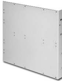
With EIA Flange