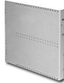
Universal With EIA Flange & Universal Hole Spacing (12mm)