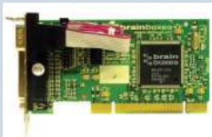
UC-464: LP uPCI 1xRS232 + 1xLPT Printer Port