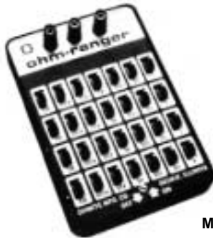
Model No. 3420

An economical, portable resistance selector with a range to over 11,000,000 ohms, in 1 ohm increments. Has three binding posts, one to ground the case.