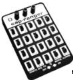
Model No. 3430

An economical, portable capacitance selector with three binding posts, one to ground the metal case.