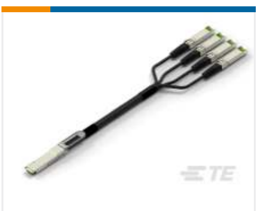
TE Part # CAT-C11-N490325 QSFP28-Four SFP+ Cable Assembly: 26 AWG