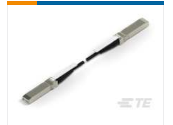
TE Part # CAT-C11-H5 SFP+ to SFP+ I/O Cable Assembly: 24 AWG