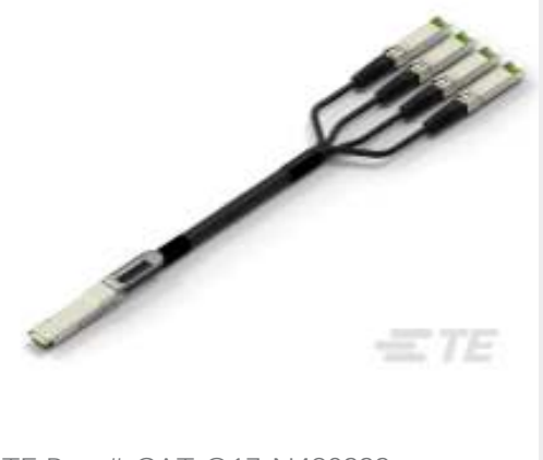
TE Part # CAT-Q17-N490333 QSFP56-Four SFP56 Cable Assembly: 26 AWG