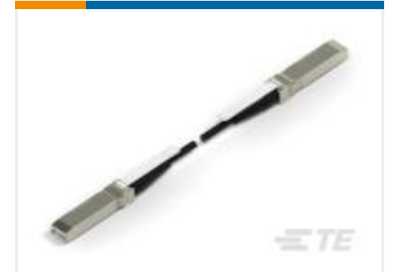
TE Part # CAT-C11-H506 SFP+ to SFP+ I/O Cable Assembly: 26