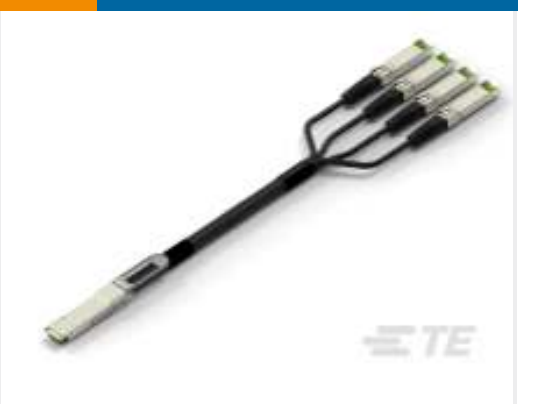
TE Part # CAT-C11-N490333 QSFP28-Four SFP+ Cable Assembly: 30 AWG