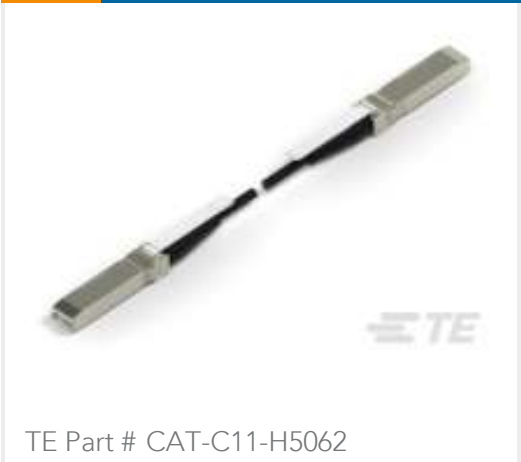
TE Part # CAT-C11-H5062 SFP+ to SFP+ I/O Cable Assembly: 28 AWG