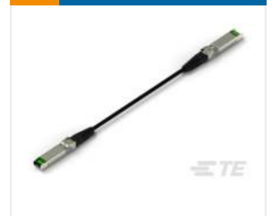
TE Part # CAT-C11-N49011 SFP28 to SFP28 Cable Assembly: 26 AWG