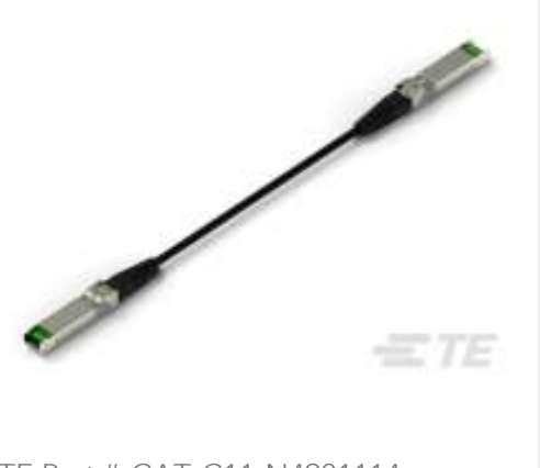
TE Part # CAT-C11-N4901114 SFP28 to SFP28 Cable Assembly: 30 AWG