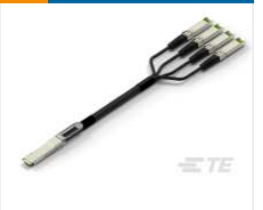
TE Part # CAT-Q17-N49011 QSFP56-Four SFP56 Cable Assembly: 30 AWG