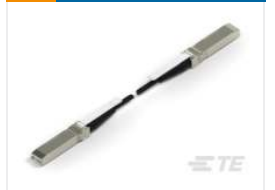
TE Part # CAT-C11-H50626 SFP+ to SFP+ I/O Cable Assembly: 30 AWG