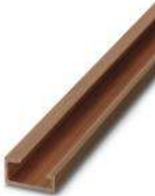
G-profile DIN rail, deep-drawn, material: Copper, unperforated, height 15 mm, width 32 mm, length 2 m

Please be informed that the data shown in this PDF Document is generated from our Online Catalog. Please find the complete data in the user's documentation. Our General Terms of Use for Downloads are valid ( http://download.phoenixcontact.com )