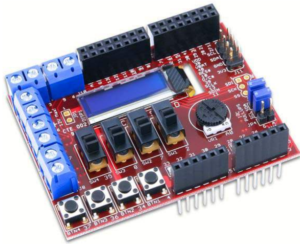
The chipKIT Basic I/O Shield.