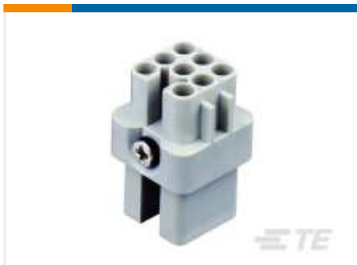
TE Part #T2020082201-000 HD-008-F