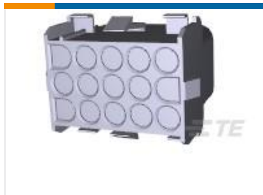
TE Part #1-480711-9 15P UMNL CAP HSG BLK