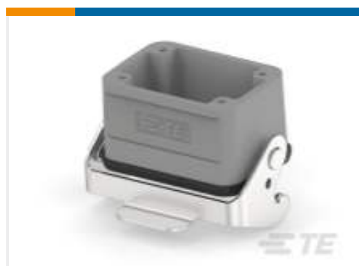
TE Part #T1730060000-000 H6B-TBF-T