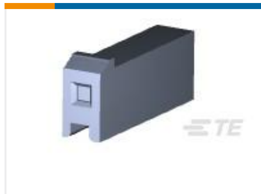
TE Part #640250-1 01P SL156 HSG W/LCK RAMP NATL