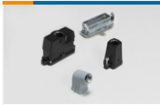
Rectangular Connector Hoods & Bases (445)