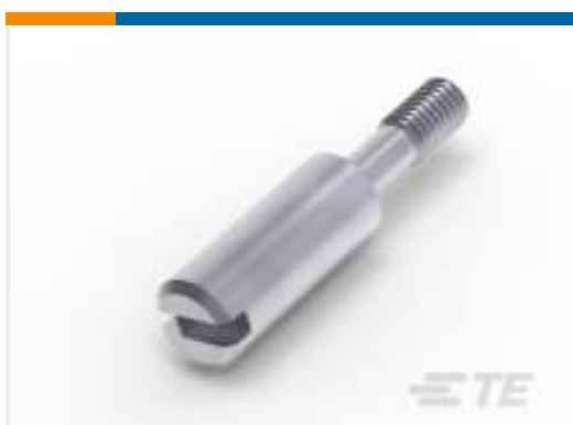
TE Part #T0931003003-000 CODING-PIN-M3