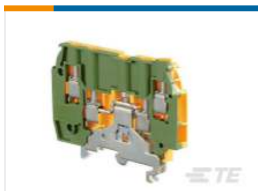
TE Part #1SNA195638R2300 M4/6.4A.P