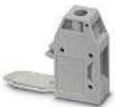
Pick-off terminal block, Connection method: Screw connection, Cross section: 0.5 mm 2 - 10 mm 2 , AWG: 20 - 8, Width: 10.2 mm, Height: 34.7 mm, Color: gray, Mounting type: On base element

Pick-off terminal block - AGK 10-UKH 50 - 3001763