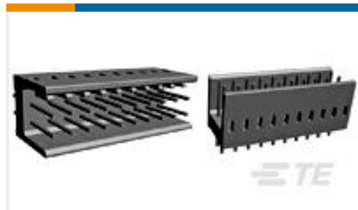
TE Part #826469-3 2X3P MOD II SHROUDED HEADER, ST