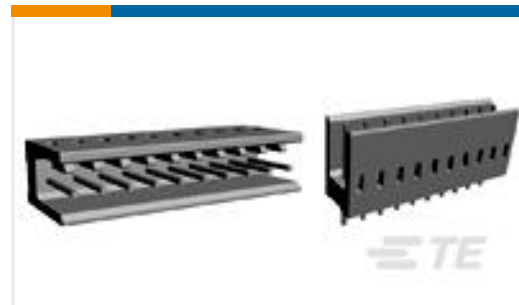
TE Part #826467-5 5P MOD II SHROUDED HEADER, ST