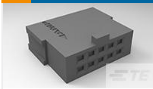
TE Part # 487223-9 034 HOUSING FFC RCPT 100CL DR