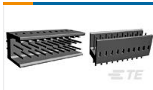
TE Part #1-826469-2 2X12P MOD II SHROUDED HEADER, ST