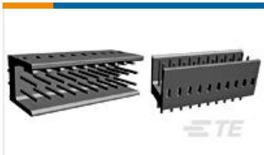
TE Part #826469-5 2X5P MOD II SHROUDED HEADER, ST