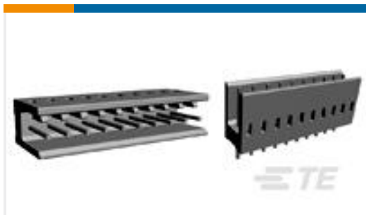
TE Part #826467-4 4P MOD II SHROUDED HEADER, ST