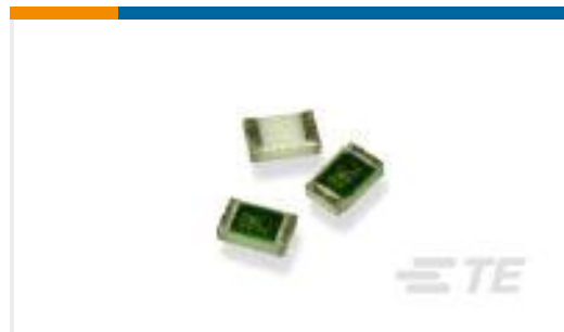
TE Part #3-1676481-6 CPF 0603 160R 0.1% 25PPM 1K RL