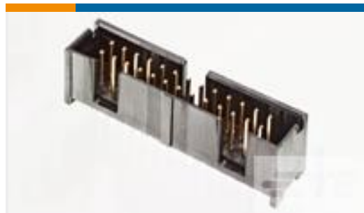
TE Part #5103308-5 A/L LOW PRO HDR 20P VERT BLACK