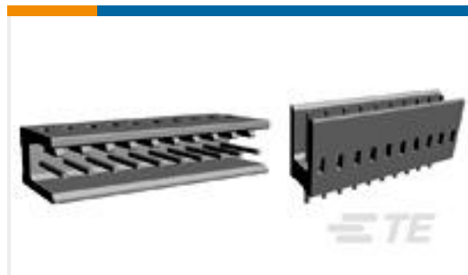
TE Part #826467-3 3P MOD II SHROUDED HEADER, ST