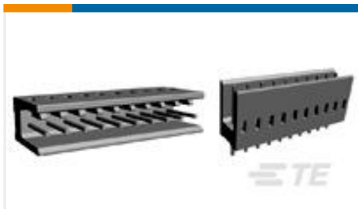
TE Part #826467-6 6P MOD II SHROUDED HEADER, ST