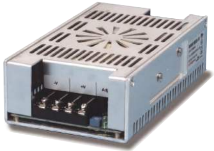
3"W x 5"L x 1.7"H