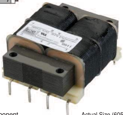
Actual Size (6051)