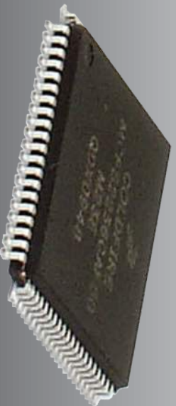
CHIP Version with 80-pin LQFP