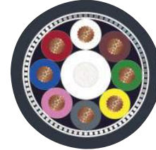
PUR halogen-free black shielded [PUR]