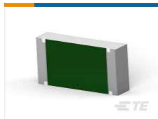
TE Part #9-2176397-0 3502 5K1 1%