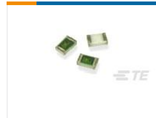
TE Part #1-1614354-0 RN 0603 511R 0.1% 10PPM CUT LENGTH