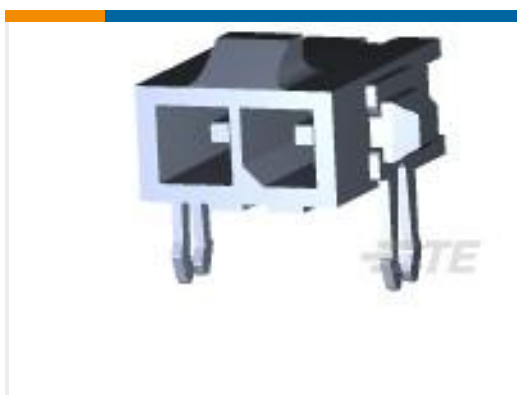
TE Part #2-1445056-2 MICRO MNL HDR ASSY SINGLE ROW