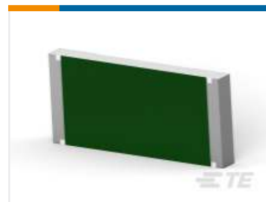
TE Part #2-2176405-0 3550 10K 5%