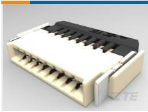
TE Part # 2328702-8 8PIN 0.5MM PITCH FPC CONNECTOR, BACK FLIP LOCK