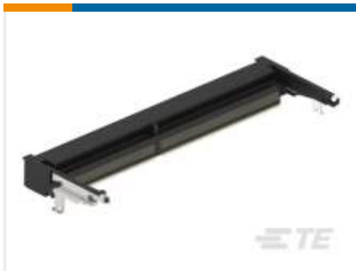
TE Part #2309412-1 DDR4 SODIMM 260P 8.0H RVS