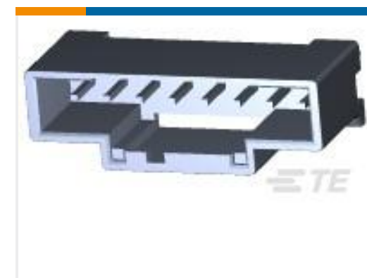
TE Part #8-1971798-1 NEW GI CONN2.5 HDR ASMBLY 8P NC D1.0