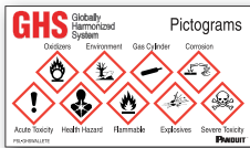
PSL-GHSWALLETE Side 1