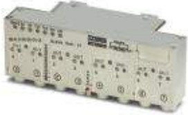
The illustration shows version IBS RL 24 DO 8/8-2A-LK-2MBD

Digital output device for INTERBUS; twisted pair with 500 kbaud, 8 outputs (24 V DC, 2 A), actuator connection via 5-pos. M12 female connectors, rugged metal housing, IP67 protection