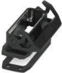
HEAVYCON EVO panel mounting base, plastic, D25, with single locking latch and flat gasket

Please be informed that the data shown in this PDF Document is generated from our Online Catalog. Please find the complete data in the user's documentation. Our General Terms of Use for Downloads are valid ( http://phoenixcontact.com/download )