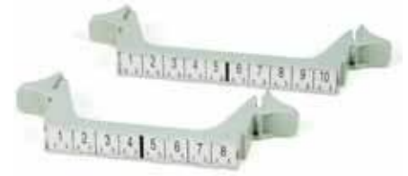
3M™ Label Holders SOR E8 and SOR E10