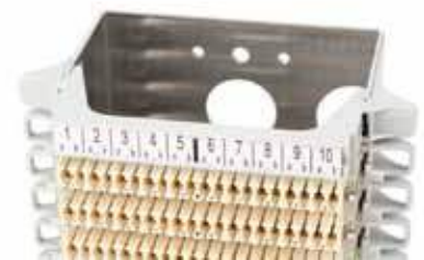
3M™ Label Holder SOR E10 on 3M™ High Density Cross-Connect Back Mount Frame STG2000