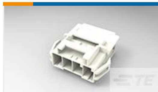
TE Part #1-1971772-4 PTL 1X4 CAP PANEL MT STD TEMP KEY A NAT