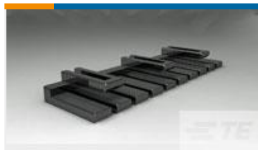
TE Part #1969443-6 EP 2.5 TPA Retainer, 6 Pos