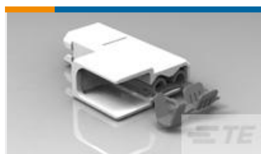
TE Part #521600-2 ULTRA-POD 187 ASY REC 22-18 AWG TPBR