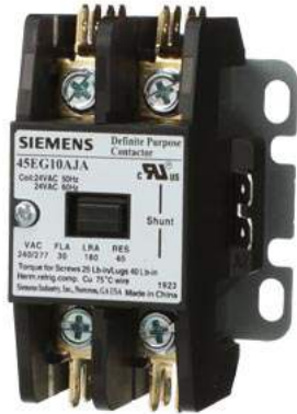
Contactor, 45DP,30A,1P,Open,277 Contactor, 45DP,30A,1P,Open,277