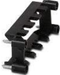
Sleeve frame, without PE, for contact insert modules, type 3, number of insert modules 4

Please be informed that the data shown in this PDF Document is generated from our Online Catalog. Please find the complete data in the user's documentation. Our General Terms of Use for Downloads are valid ( http://download.phoenixcontact.com )