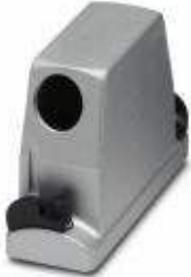
HEAVYCON ADVANCE EMV sleeve housing B24, with bayonet locking, height 100 mm, with 1xM32 thread, lateral cable outlet

Please be informed that the data shown in this PDF Document is generated from our Online Catalog. Please find the complete data in the user's documentation. Our General Terms of Use for Downloads are valid ( http://download.phoenixcontact.com )