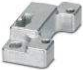
Panel mounting flange for HEAVYCON ADVANCE TMB housing with bayonet locking