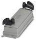
HEAVYCON ADVANCE IP65 protective cover B24, with bayonet locking, with retaining cord, diameter of retaining cord eyelet 3 mm

Protective covers - HC-B 24-TMB-SD-IP65 - 1690969