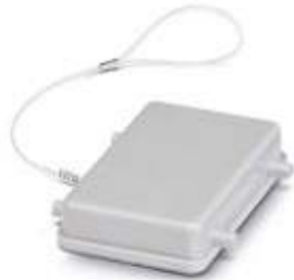
HEAVYCON protective cover, type D50, for supporting base element with single locking latch, with retaining cord, IP54, PA

Please be informed that the data shown in this PDF Document is generated from our Online Catalog. Please find the complete data in the user's documentation. Our General Terms of Use for Downloads are valid ( http://download.phoenixcontact.com )