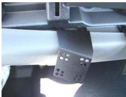
InDash in (3rd) location