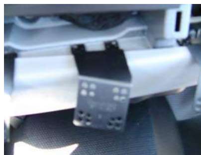
InDash in (2nd) location