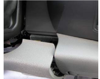
Knee & dash panel split

Read instructions completely prior to starting installation. All InDash Mounts are designed so that after installation, phone is facing normal driver position for left-hand drive vehicles. This mount is not designed to be used in foreign countries with right-hand drive vehicles. Use extreme care when working around the plastic components on the dash. Excess force, can cause breakage of the plastic components.